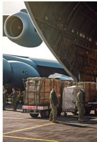
MILITARY AND UN CARGO