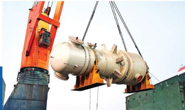
HEAVYLIFT CARGO on container vessel