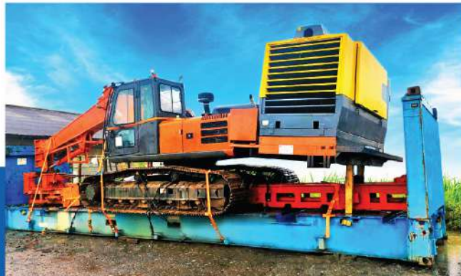
ODD DIMENSIONAL CONTAINERISED CARGO (ODC) on our own special equipment