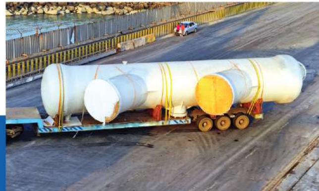
BREAKBULK, HEAVYLIFT, vessel owning & chartering