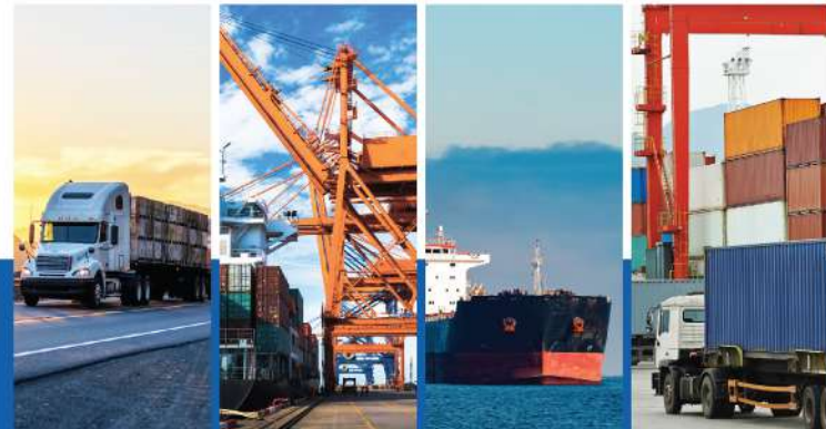
END-TO-END PROJECT LOGISTICS (road transport, custom clearance, stuffing / operations)